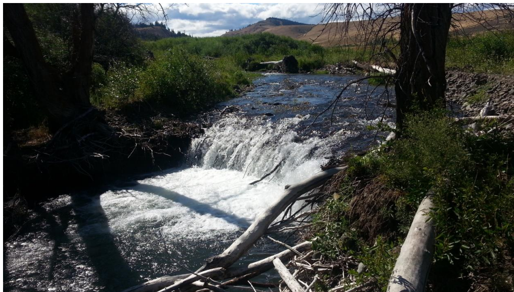
Figure 2. Present location of headcut. Hydraulic drop at low flow approximately 3.5 feet.