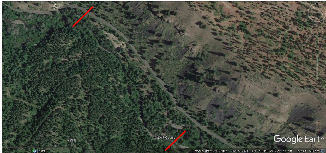
Figure 5. Site #4 project location shown between red bars. Parking/camping area located near upstream (upper left) end of figure.

Site #4 – Section 34 floodplain, WDFW ownership: Township 19N, Range 16E south half Section 34. Disconnected floodplain, public access location, dispersed camping typify this site (see figure 5).