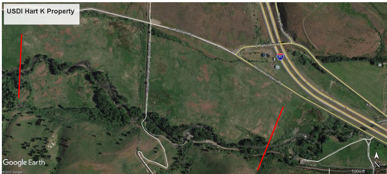
Figure 3. Site #2 project location shown between red bars.

Site #2 – USDI BOR Heart K property. This site is located immediately upstream of site #1. This property comprises the entire geomorphic floodplain and was purchased by USDI BOR for habitat conservation approximately 15 years ago. The property includes an irrigation diversion structure for Taneum Canal Company, a spillway from the Kittitas Reclamation District and a reverse syphon (undershot) for the same. These features limit the scale of habitat restoration that can be implemented, however stream habitat upstream and downstream of the diversion and syphon/spillway lacks instream wood for the entirety of the 1.1 mile stream reach encompassed by this ownership. See figure #3.