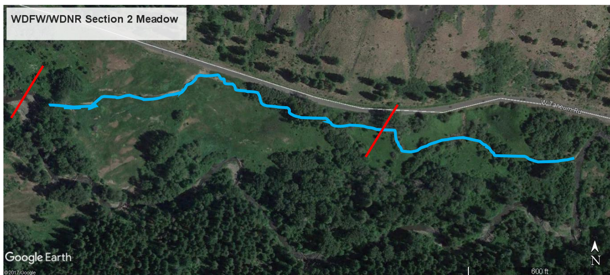
Figure 4. Site #3 project location shown between red bars. Blue line denotes approximate location of high flow channel.

Site #3 – WDNR, WDFW Floodplain. This site is located approximately two miles upstream of Site #2. The drive from the upstream border of site #2 is approximately 2.5 miles. The road-adjacent portion of this floodplain area is owned by Washington Department of Natural Resources, while the area farther from the road is owned by Washington Department of Fish and Wildlife. The paved road accessing the area is managed by USFS. The floodplain is seasonally inundated during high stream discharge, and was used for motorized recreation until the early 1990's, when vehicular access was blocked. Floodplain plant succession is ongoing, however woody riparian plants and the floodplain roughness they provide is absent in much of the 18 acre floodplain meadow. Since the 2011 flood, the overflow channel that inundates this area has been scouring a channel immediately adjacent to the road. See figure #4.