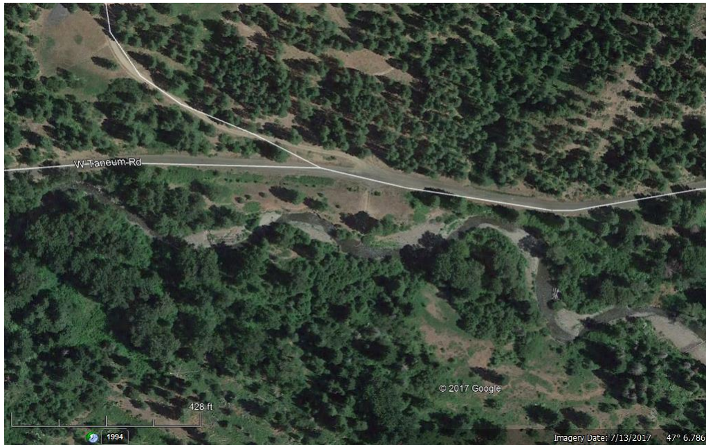
Figure 6 - Cedar Creek meadow. Stream flow is from left to right.

Site #6 – WDFW/USFS Boundary Site: one crow-mile upstream of site #4: Located within Township 19N, Range 15E Sec 25, Township 19N, Range 16E Sec 30. Site restoration objectives include wood placement for pool and complex channel formation, possible increases in floodplain inundation. Level of analysis required for this site is considered to be extremely low at this site. Loose wood placement designs for permitting on USFS ownership. The site does not allow access for heavy equipment, thus wood placements will be via griphoists, or lining from tractor-mounted winches. Loose wood will be placed, and simple designs depicting these are required for NEPA. Installation shall be based upon budget limitations and YKFP staff capacity to implement. As much as 150 individual pieces of large wood may be placed in the stream and geomorphic floodplain. See Figure 7.