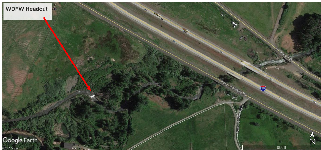
Figure 1 Taneum Creek - flow from left to right. Headcut location shown.

Site #1 – WDFW Headcut. The site is located at Creek Mile 1.9 m/l, approximately 1000 feet upstream of the Thorp cemetery Road Bridge, and Interstate 90 bridge crossings of Taneum. This parcel includes the entire geomorphic floodplain upstream of the county road up to the next upstream ownership. The parcel was purchased on 12/2015 through collaboration with YKFP and WDFW, and is now permanently protected for fish and wildlife habitat. On the property, Taneum Creek flows over a 3' vertical headcut this may completely block upstream passage of juvenile salmonids, while posing serious passage problems for adult coho salmon and resident trout during some flow discharges. See Figures 1 and 2 below.