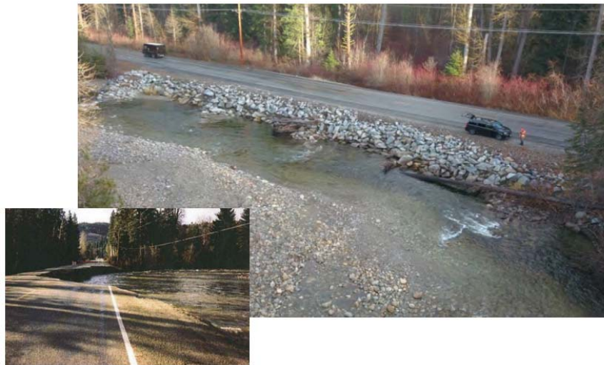
Photos of the upper SR 207 Chronic Environmental Deficiency site along Nason Creek where roadway stability and fish habitat need to be addressed.