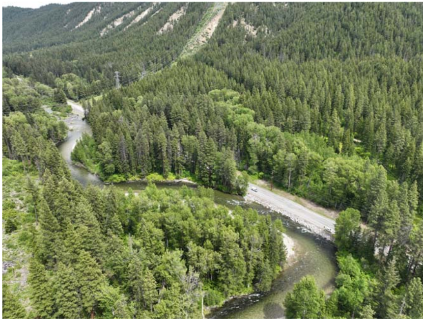
Aerial photo of the upper and middle SR 207 Chronic Environmental Deficiency sites along Nason Creek.