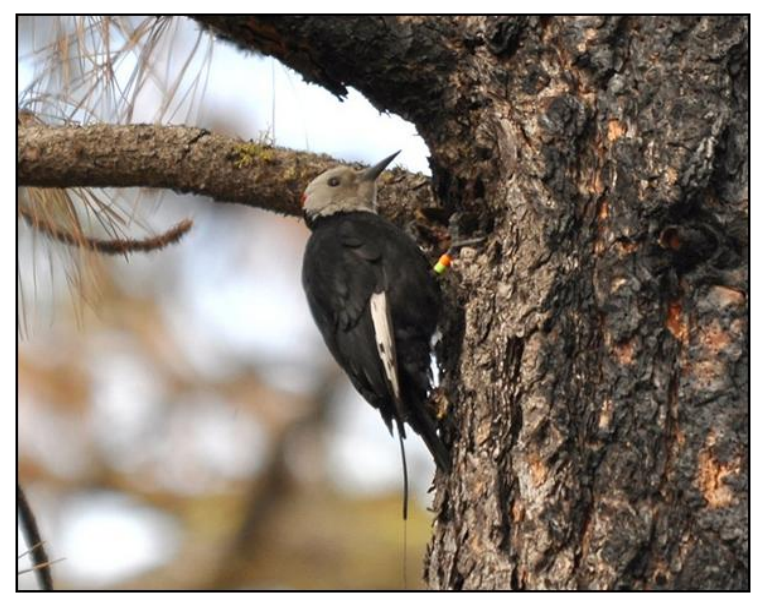
Figure 6. Radio-tagged white-headed woodpecker foraging on a ponderosa pine on Bethel Ridge, WA. Woodpeckers in this study consistently foraged on smaller diameter trees than reported by Dixon (1995a), suggesting greater plasticity in their foraging behavior.

Radio-tagged white-headed woodpeckers in this study foraged on a wider variety of trees than those reported in old-growth stands in Oregon (Dixon 1995a). Dixon (1995a) reported that whiteheaded woodpeckers in Oregon foraged nearly exclusively on ponderosa pine (98% of observations; Table 3), whereas birds in our study foraged approximately 25% of the time on Douglas-fir ( Pseudotsuga menziesii ) and grand fir ( Abies grandis ) trees, especially those infected with western spruce budworm ( Choristoneura occidentalis ). This is more similar to foraging by white-headed woodpeckers reported by Raphael and White (1984) in California, who found them foraging on firs ( Abies spp.) 44% of the time. Interestingly, in our study a wider variety of trees were used by birds feeding fledglings (0.29% of time on non-pine species) compared to adults without young (0.06% of time on non-pine species) (Figure 6). Birds with fledglings may select a wider variety of foraging substrates because of the higher demands placed on them by dependent young.