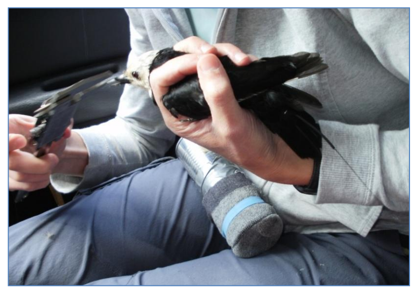
Figure 4. Measuring culmen length on a radio-tagged adult female white-headed woodpecker at Rimrock Lake, WA.

We radio-tagged eight female and nine male white-headed woodpeckers. Four individuals shed their transmitter within weeks of capture and were not tracked. Among the remaining birds, we obtained over 500 telemetry relocations and 2000 minutes of behavior observations, and estimated post-nesting home range size (July-September) for nine individuals. Seven of these woodpeckers successfully nested, and two failed in their nesting attempt, allowing us to compare space use by successful and unsuccessful breeders.