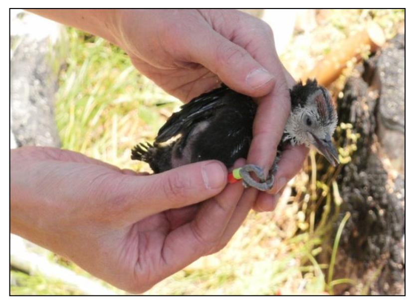
Figure 2. Color-banded white-headed woodpecker nestling from the Rimrock Study Area.

areas: Rimrock Study Area (Naches Ranger District, Okanogan-Wenatchee National Forest) and Wenas Study Area (Wenas Creek Wildlife Area, Washington Department of Fish and Wildlife) (Figure 1). If possible we hope to add the Mission Creek Study Area (Wenatchee River Ranger District, Okanogan-Wenatchee National Forest) as a primary study area for colorbanding in 2012. Resightings of color-banded woodpeckers in future years will provide insights into survivorship, site fidelity, mate fidelity, and juvenile dispersal. Genetic samples from all captured woodpeckers will enable us to examine the population genetic structure, as well as provide much-needed information on dispersal and mating systems. Color-banding of nestlings and intensive genetic sampling within a single population has not occurred for white-headed woodpeckers anywhere in their range.