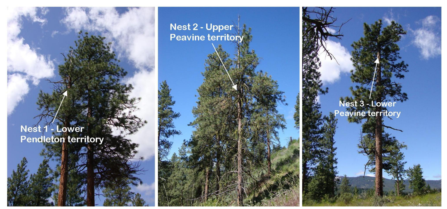
Figure 3. These three nest cavities are unusual nest sites for white-headed woodpeckers, being both higher than average and in live ponderosa pine trees. The three pairs that created these nests inhabited the same watershed in the Mission Creek Study Area, and were also neighbors, occuring within a 70 ha block of land. Given the uniqueness of these sites and their close proximity, factors besides habitat features, such as natal experience or habitat copying, may have influenced the selection of nest sites by these three pairs.

We were surprised to find some localized patterns of nest-site selection, where individuals in a small area selected nest sites that were similar to each other, but very different from those of the larger population (Figure 3). For example, although white-headed woodpeckers rarely nest high above ground or in live ponderosa pine trees, three nests in adjacent territories in the Mission Creek Study Area occurred high in a live ponderosa pine tree, despite an abundance of more typical nest snags. The similarity of these three nest sites and their contrast to the majority of nest sites reported for white-headed woodpeckers (e.g., low height and in moderately decayed dead trees; Raphael and White (1984), Kozma (2009)) suggest that these three pairs may have acquired their unusual nest-site preferences either from copying the behavior of their neighbors, or from similar and localized natal or personal experiences (e.g., Valone 2007). The importance of such non-habitat 'social' factors on nest site selection has not been studied for any North American woodpecker and we suggest that future studies of white-headed woodpecker nesting ecology consider the potential influence of such factors on nest-site selection.