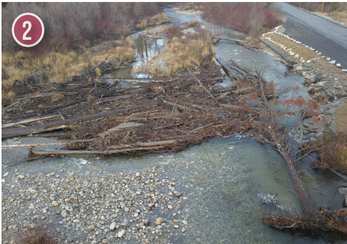
Looking downstream towards CED site #2