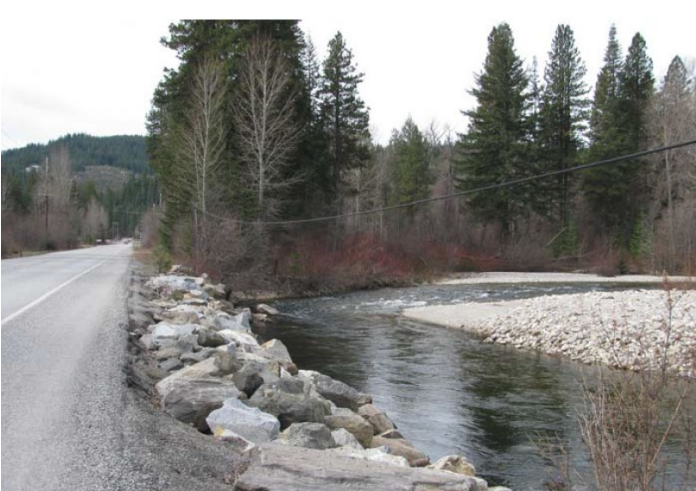
CED site #1: 2010 site conditions in Nason Creek where there have been 3 road maintenance repairs in the last 10 years.