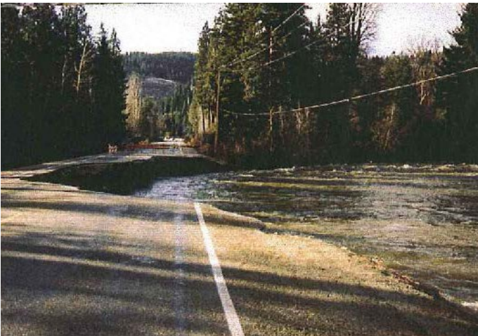
CED site #1: 1995 flood that washed out the SR 207 road prism near RM 4.5. Photo taken from the north looking south.