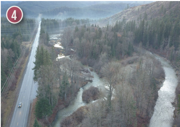
Looking upstream from CED site #3