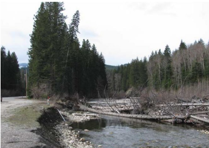
CED site #2: April 2010 site conditions in Nason Creek under the powerline crossing.