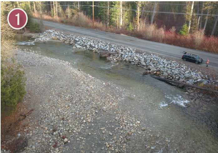
Looking downstream towards CED site #1