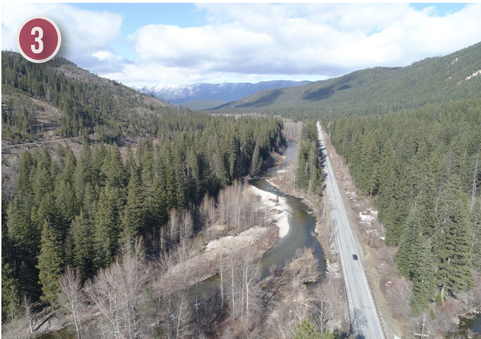
Looking downstream towards CED #3