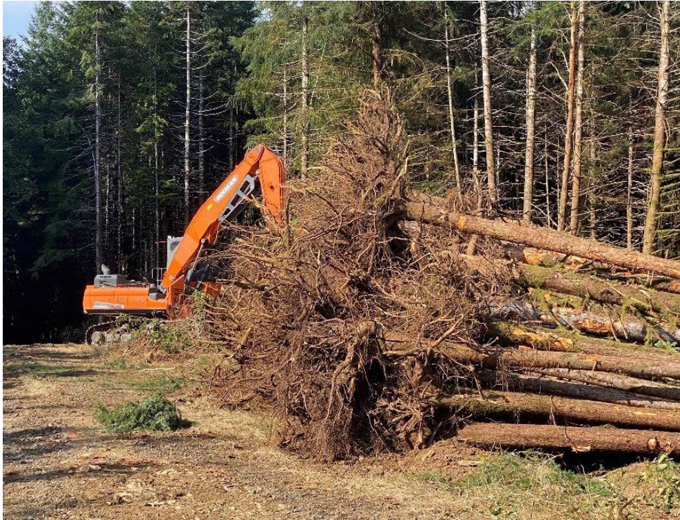
Photo 1: Example rootwad logs with full root fan. No rootwad trimming needed