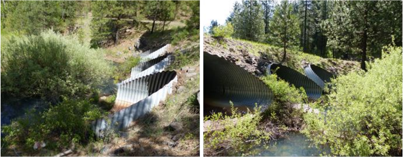
Figure 2. Brush Creek 175 Road Crossing Culverts limit fish migration, trap sediments, and restrict the passage of wood and sediment (downstream on left, different angle of downstream end of culverts on right).