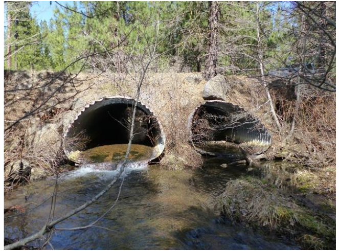
Figure 4: White Creek 191 Road Crossing: upstream (left), downstream (right)