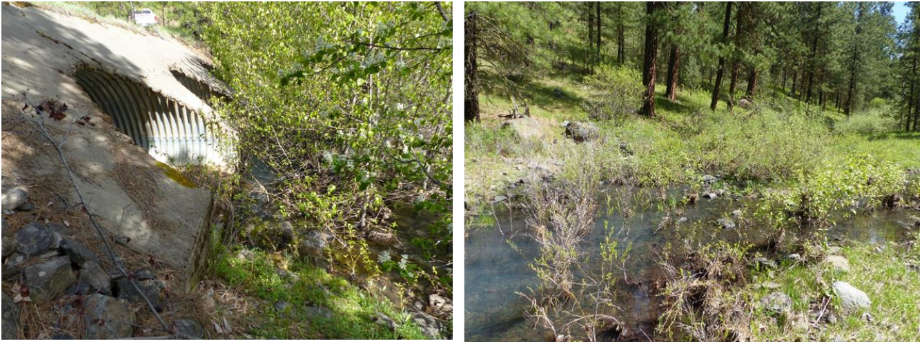
Figure 3. Brush Creek 175 Road Crossing Culverts (upstream on left, conditions upstream of culvert on right).