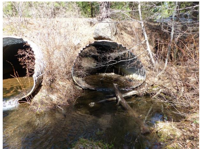
Figure 5: White Creek 191 Road Crossing: Close-up photos of downstream side of double culvert.