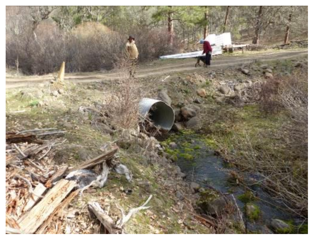
Figure 3. Northern Lover's Lane road crossing.