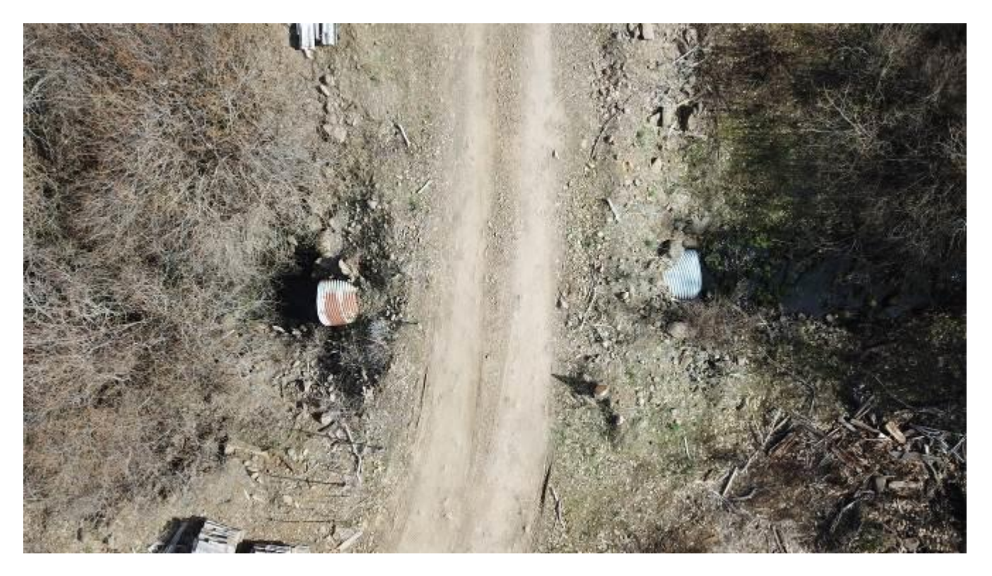
Figure 5. Aerial view of Southern Lover's Lane road crossing.