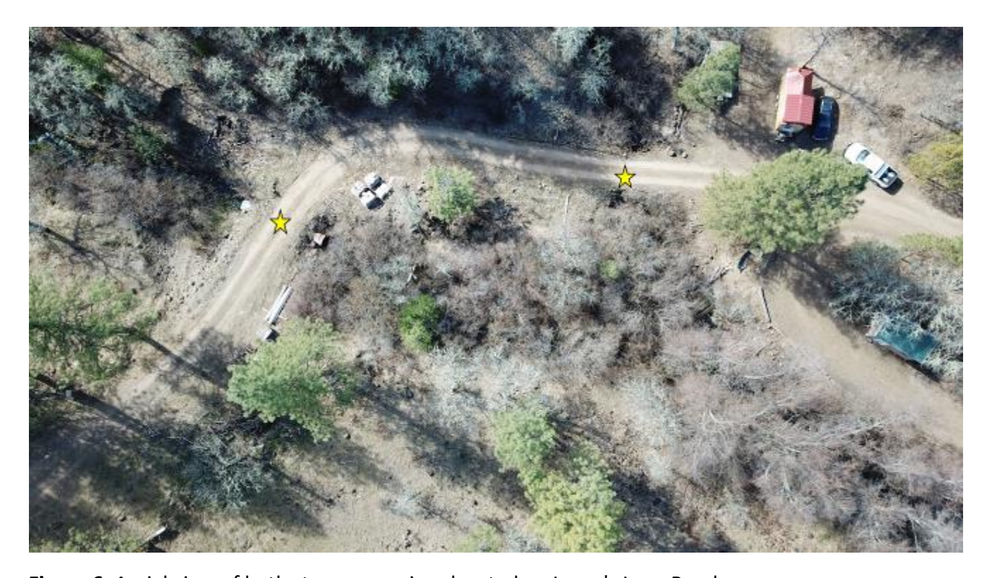
Figure 6. Aerial view of both stream crossings located on Lover's Lane Road.