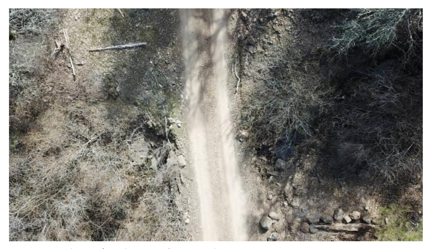
Figure 4. Aerial view of Northern Lover's Lane road crossing.