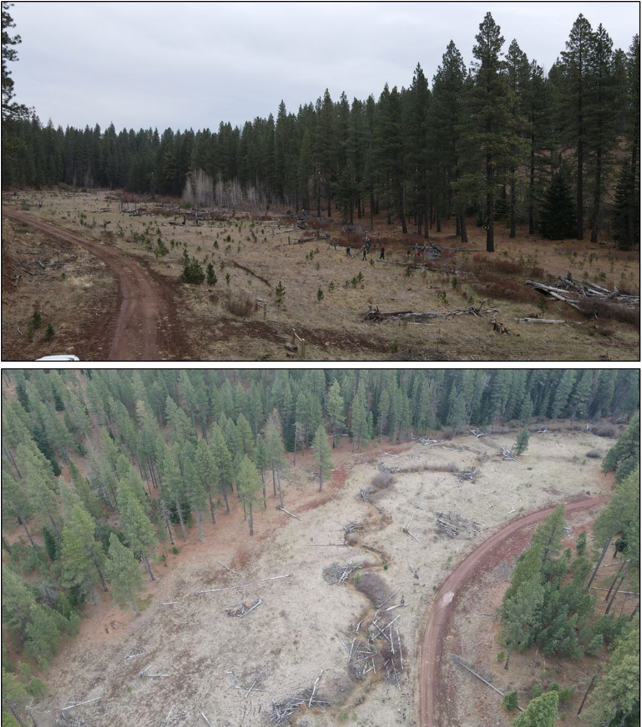
Figure 2. Photos depicting channel and riparian conditions within a meadow reach of the LTPBR project.