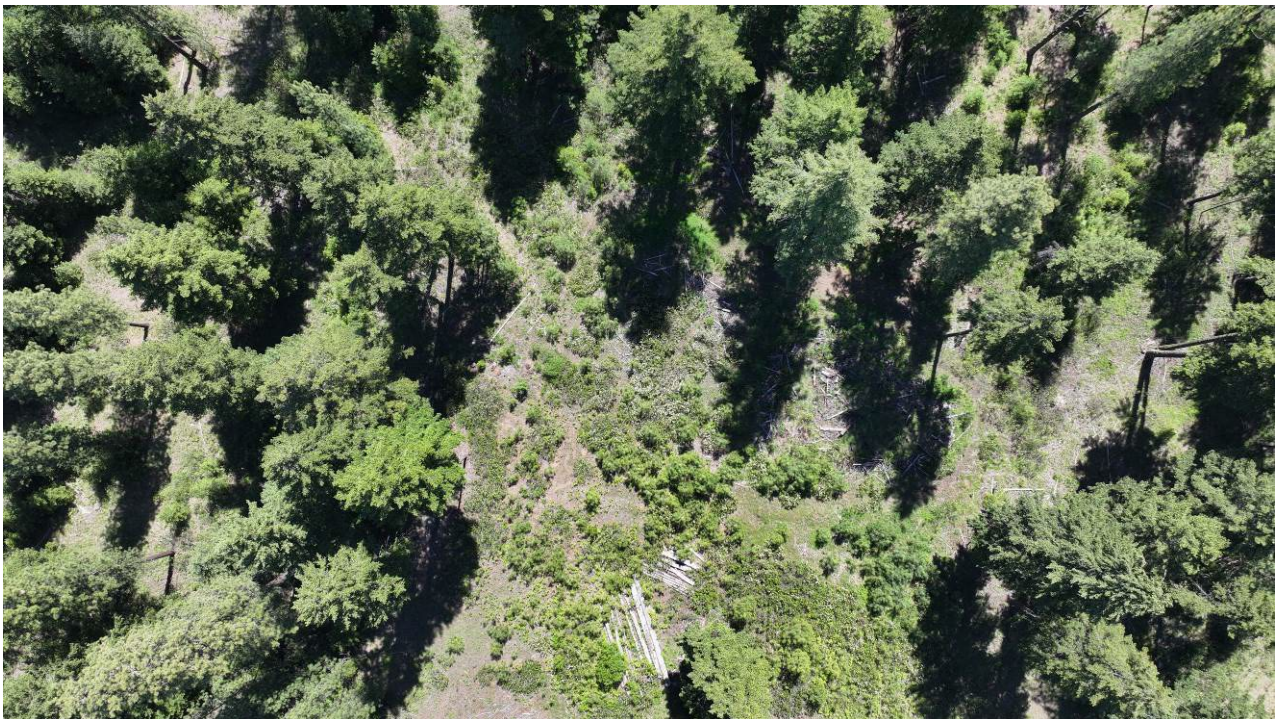
Figure 7. Oak Hill 2 landing, brush shall be cleared and opening created to stockpile wood.