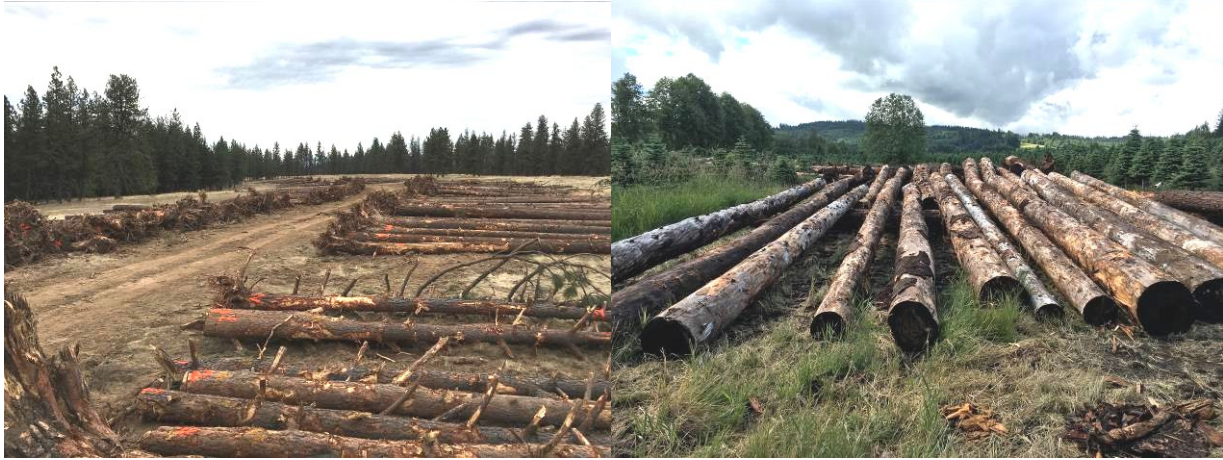
Figure 1. Example of landing preparation with stockpiled logs set out individually.