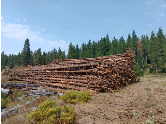
Figure 3. Log Stockpile at Draper Springs in Glenwood.