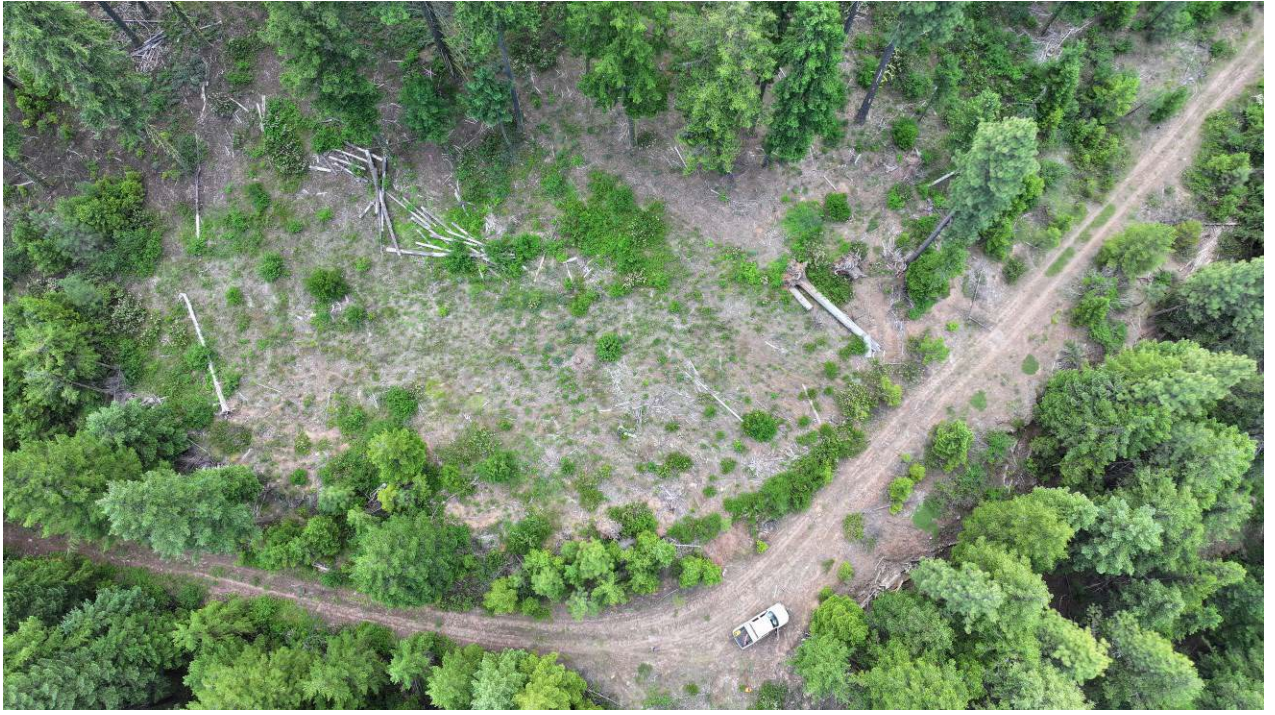
Figure 9. Twin Buttes 4 landing, wood to be arranged upslope of road in opening.