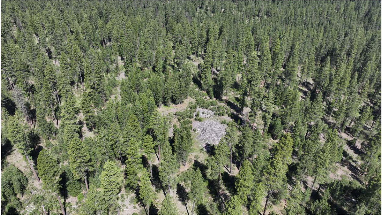
Figure 6: Oak Hill 1 landing, wood should be stockpiled around existing slash pile and brush and young trees cleared to make wood easily accessible.