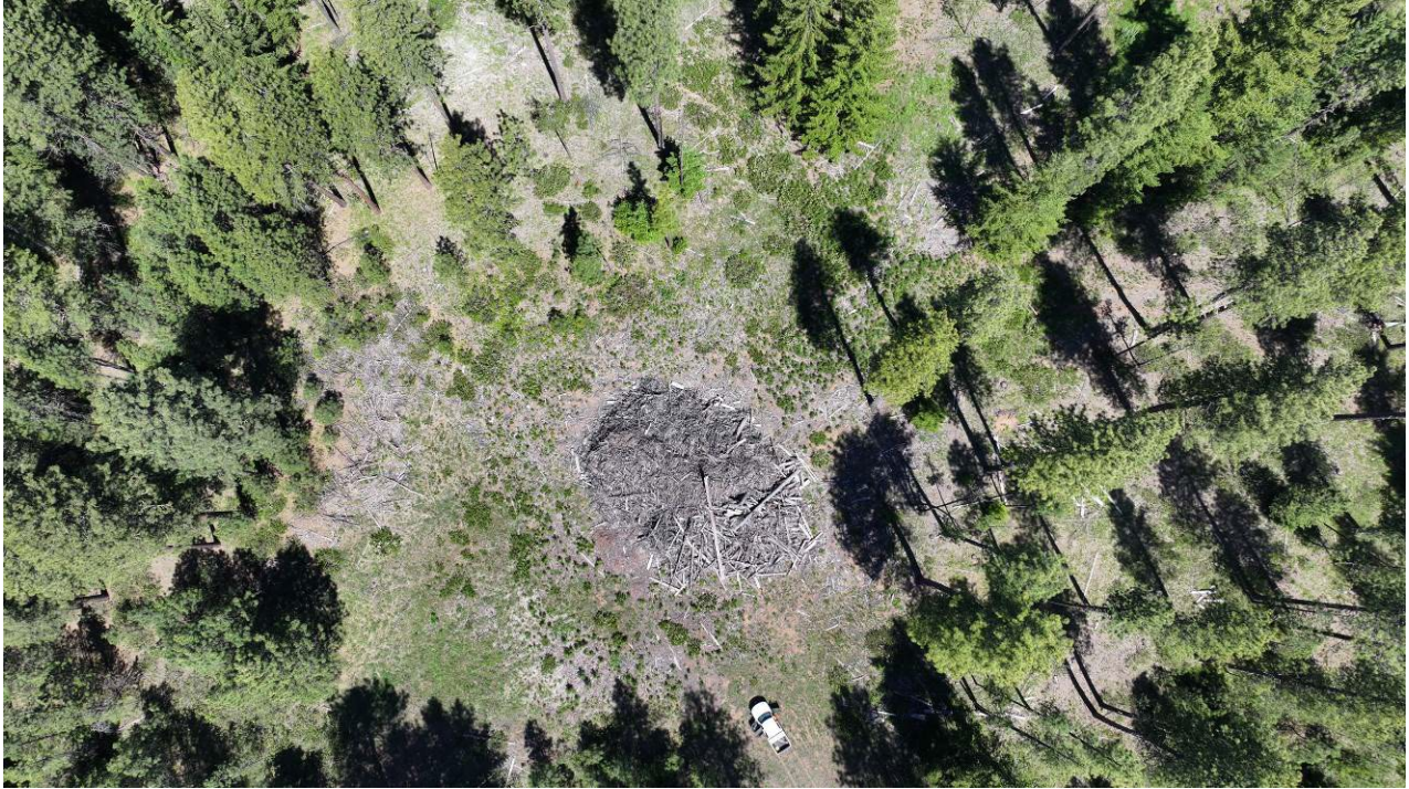
Figure 8: Twin Buttes 3 landing, wood to be arranged around existing slash pile.