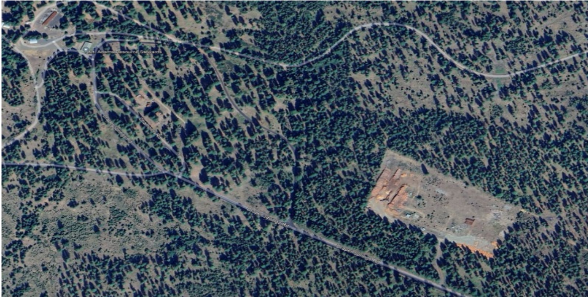
Figure 2. Aerial view of log Stockpile at Draper Springs in Glenwood.

Approximately 100 logs currently stockpiled at Mt Adams Resource Stewards (MARS) log yard at Draper Springs (46.020968, -121.335597, Glenwood, WA (Fig. 2)) will be hauled to landings Twin Buttes 3 & 4 via the Klickitat River Road and Summit Creek. Logs have rootwads intact and are 8-14” in diameter (Fig. 3). Haul distances are 30-32 miles. The Summit Creek and 207 Road will need to be watered for dust abatement. The OWNER will request and provide the permit and location of withdrawal from YN Water Code.