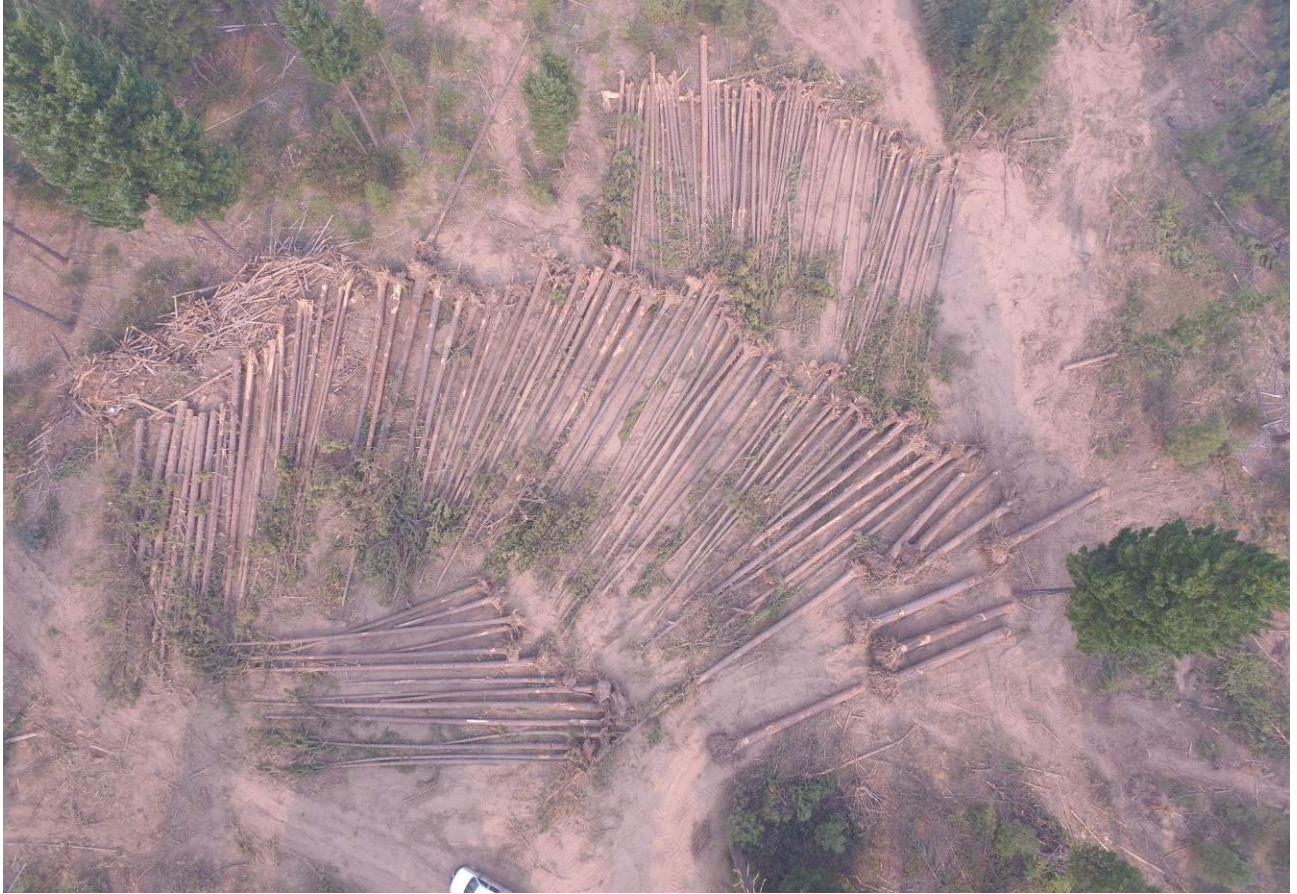
Figure 10. Example of what landings should look like when completed.